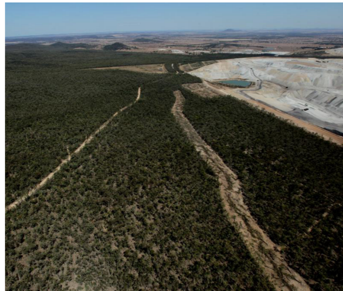
Open cut coal mining encroaching on Leard State Forest, NSW.

In Australia, open cut coal mining in the Leard State Forest, dredging to construct coal and gas export facilities in the Great Barrier Reef World Heritage Area and invasive coal seam gas mining in some of Queensland's most fertile farmlands serve as prominent recent examples. Studies show that particulate pollution from coal mining and combustion result in health costs to humanity in the order of billions of dollars, and tens of thousands of premature deaths per year.(2)